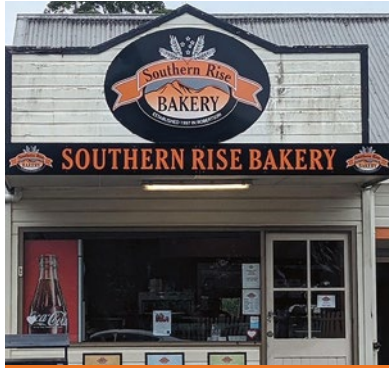
Southern Rise Bakery, Robertson