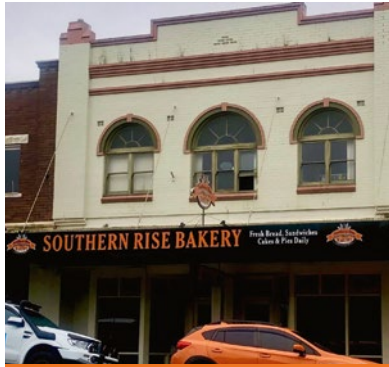
Southern Rise Bakery, Moss Vale